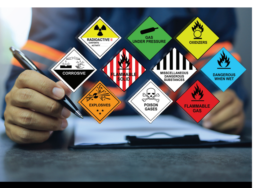
Hazardous Materials Regulations: A Regulatory Primer