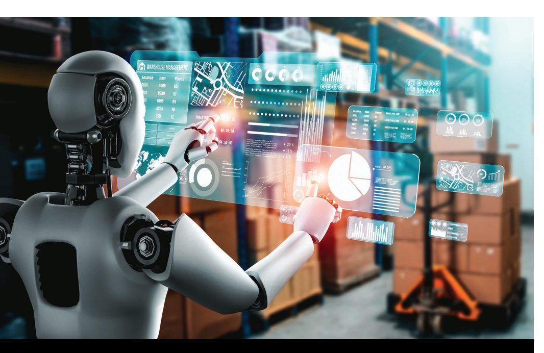
Al in the Supply Chain Under Government Focus