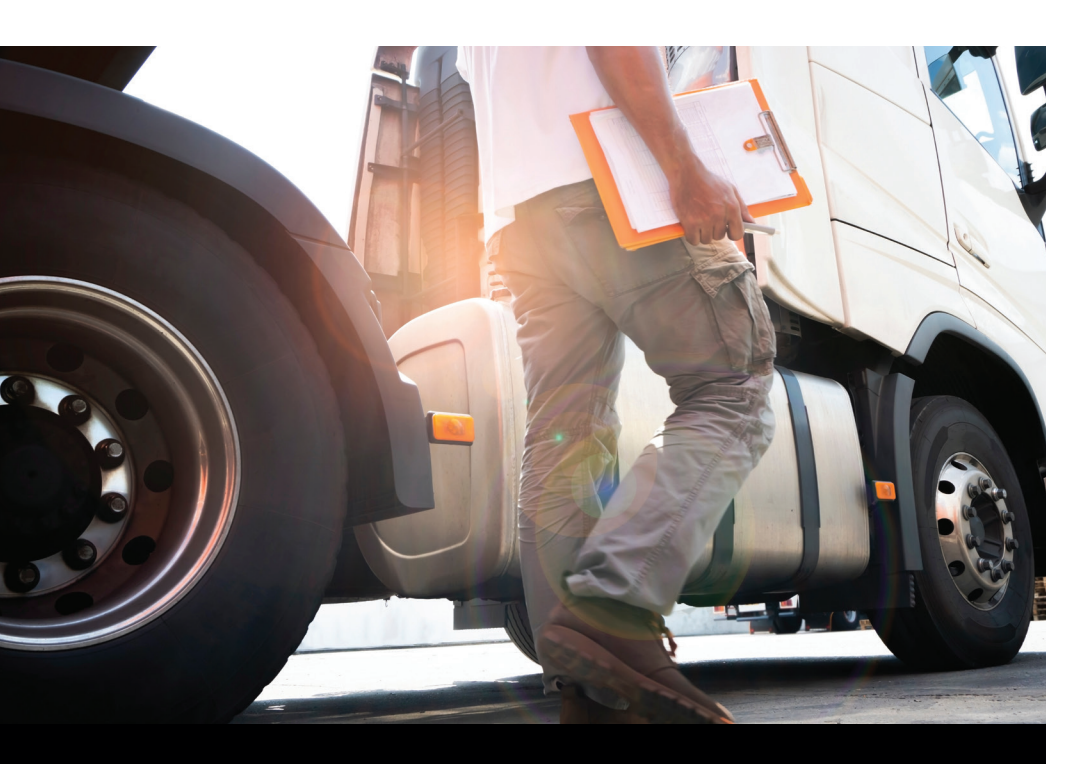
Motor Carrier Safety Department – Why You Need One, How To Improve Yours