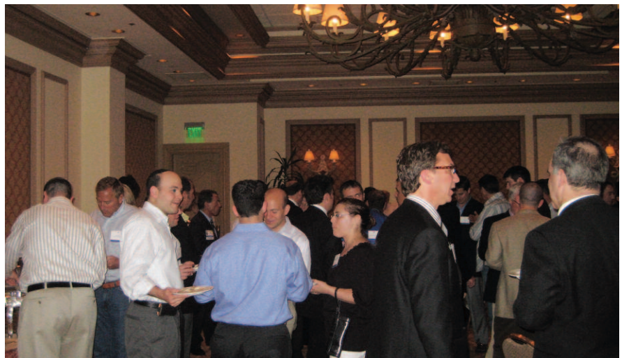
Benesch's cocktail reception was attended by approximately 115 clients and friends of the firm.