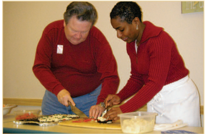
The Gathering Place offers cooking classes and nutritional guidance.