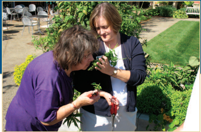
The Gathering Place provides a gardening program to those it assists.

Benesch has a long-standing relationship with The Gathering Place, and many of our attorneys and staff have personal connections to the organization and its mission. The firm regularly participates in "Race for the Place," an annual 5K/1 mile event hosted by The Gathering Place. Race for the Place helps to raise the money that allows The Gathering Place to offer all services free of charge. This year, the race was held on