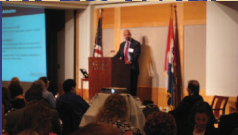
Pete Kirsanow addresses attendees on the Employee Free Choice Act and other recent federal legislation.