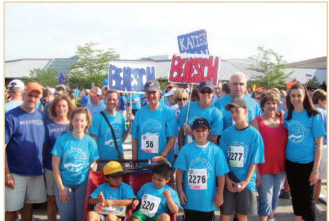
Team Benesch gathers for a photo on race day.

National Cancer Survivors Day, June 7, 2009. Team Benesch showed up strong, with over 20 participants and a total of $1,500 in money raised.