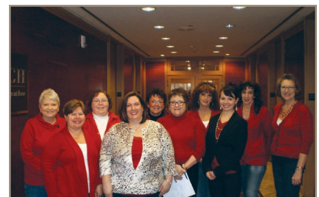
Indianapolis Wears Red