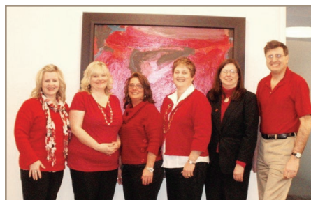
Columbus Wears Red

This marks the 10th year of the American Heart Association's Go Red For Women® movement—10 years of fighting to save women's lives from heart disease. At Benesch, we are ready to rise to the challenge and make this year a turning point in the fight against heart disease. On February 1st, Benesch attorneys and staff each donated $5 for a "jeans day" and wore red attire in support of the American Heart Association's Go Red For Women® movement. All proceeds went directly to the American Heart Association. The money raised will help fund lifesaving educational programs and the development of new treatments to fight heart disease.